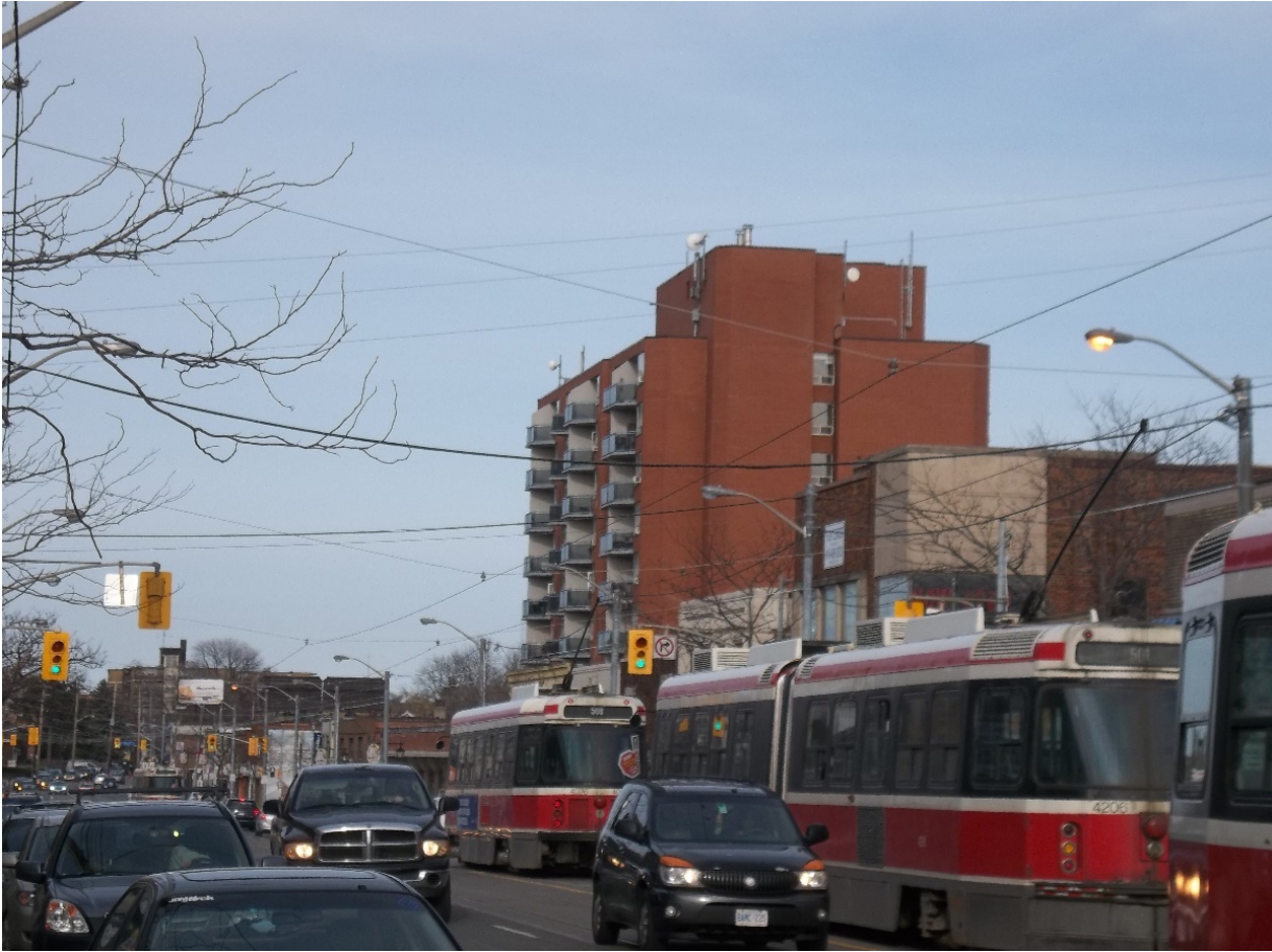
1) New Toronto – Typical transit headway