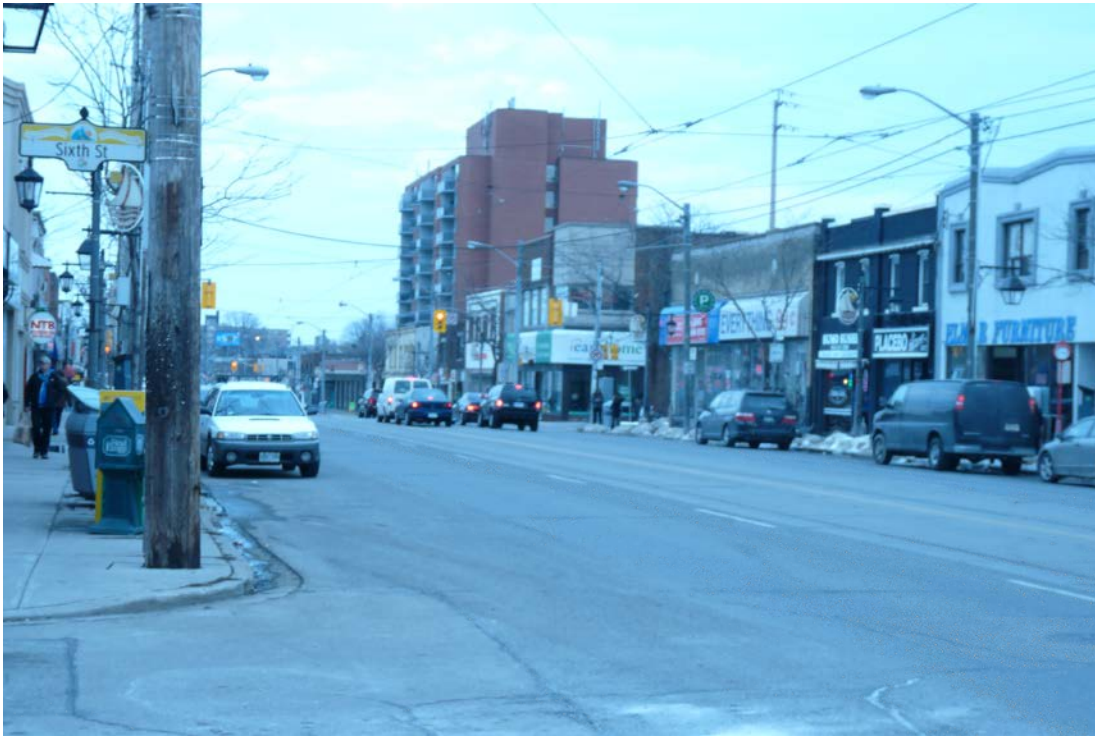
2) New Toronto – typical road allowance, looking east at Sixth St (63.7 ft / 19.4 m, curb-to-curb)