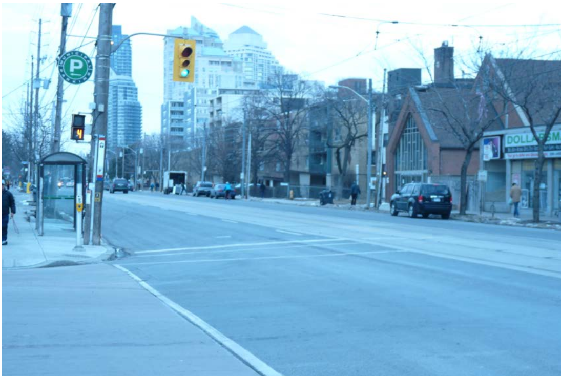
3) Mimico – Road allowance looking northeast at Superior Ave. (62.8 ft / 19.1 m, curb-to-curb)